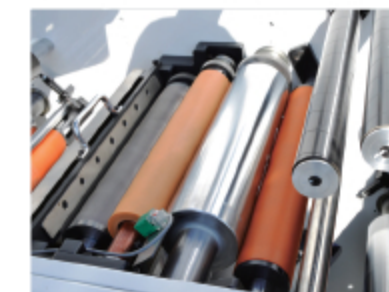
柔印工位 Flexographic station