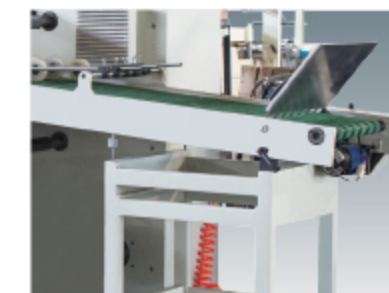
全切输送平台 Full cut conveyor