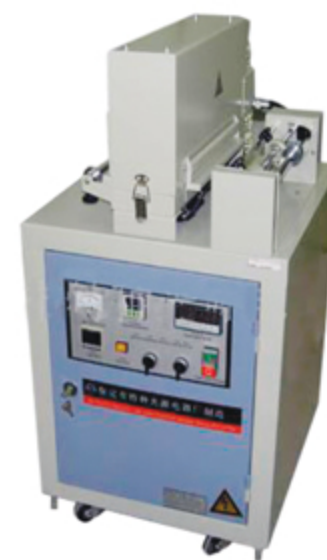
UV光固机 UV Drier

注:印刷速度视印刷材料、印刷长度及印品要求而定。 Note: The printing speed will be decided by the quality of printing material, printing length and printing requirement.